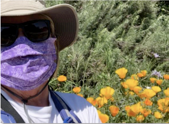
Who is that Safe-at-bloom? See Page 5