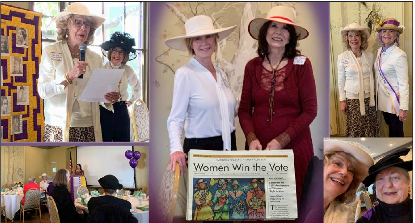
LACIC Centennial Tea Moments from March 8

Due to our current situation, final decision on EPC meeting (on April 9) will be determined as we near the date. We hope that all of you are safe and well and managing in this difficult time. We are here for each other so if you need anything please let us know.